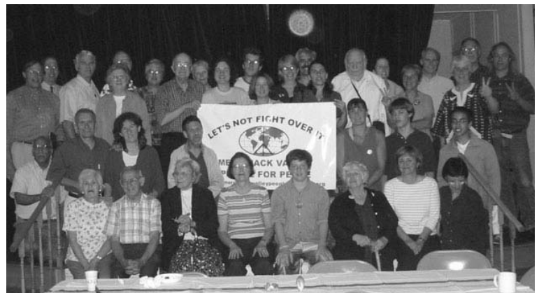
MVPP 20th Anniversary meeting, June 2004.

STONE SOUP Supper You are invited to MVPP's annual 'STONE SOUP' supper, Tues, Nov. 23, 6:30 P.M. at the North Parish Church, (Old North Andover Common) sharing a simple meal of bread and soup. Donations from this fasting day will go to Oxfam America's Fast for a World Harvest fund drive. After the meal MVPP will conduct a brief meeting, followed by a video of pertinent interest to our group.